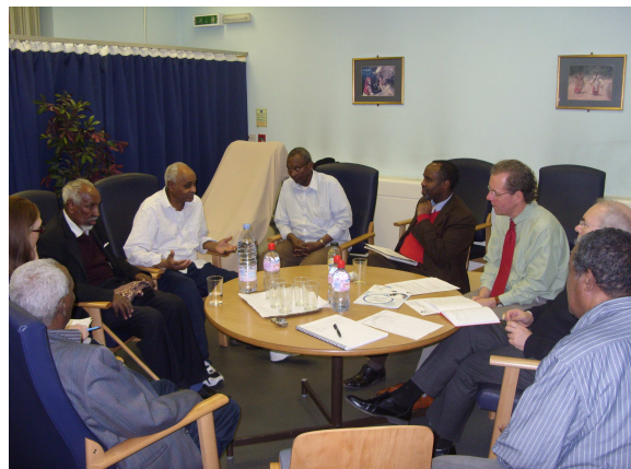
Focus group sessions with residents from the Somali Community

65. Members agreed that there was a greater need for inter community working and a greater sharing of resources between different communities. In addition to this there was also a need to educate Youth Workers to integrate different communities both inside and outside of community centres. The Working Group stating that there was cross organisational working but not enough cross cultural working which was the key issue that needed to be resolved.